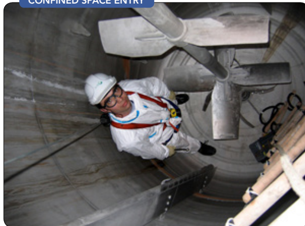
Figure 3. Manual cleaning in confined spaces raises safety, human error, and labor cost concerns.

method is unreliable, time-consuming, and requires excessive amounts of water.