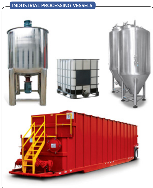
Figure 1. Modern cleaning equipment can safely and sustainably clean storage or process tanks, drums, blenders, reactors, kettles, mixers, shipping containers and more.

“We hear from companies daily that have had product recalls due to cross-contamination. Some