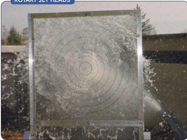
Figure 4. Impingement cleaning uses the mechanical force of the wash fluid to scour tanks clean.

able, easy to use and maintain, and able to be validated per current industry regulations. Key advantages of the rotary devices include: