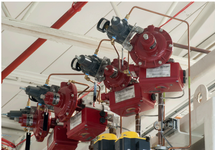
Figure 4. The Badger Meter RCV Model 9000 globe-style control valve.

Some globe valve designs feature a bolted bonnet and post-guided inner-valve. They are well suited for modulating control of liquids and vapors in environments where compact size, coupled with the ability to withstand high temperature and pressure, are essential (See Fig. 4).