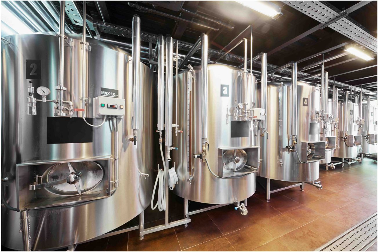
Figure 1. Control valves play a crucial part in complex process plant operations.

Modern control valve designs allow them to be used simply as an on and off device, or for any combination of controlling to include regulation, modulation, mixing or even isolation. They are a highly engineered instrument and should not be treated simply as a commodity. Addressing control valve performance has a dramatic impact on plant efficiency, overall profitability, and asset lifecycle costs.