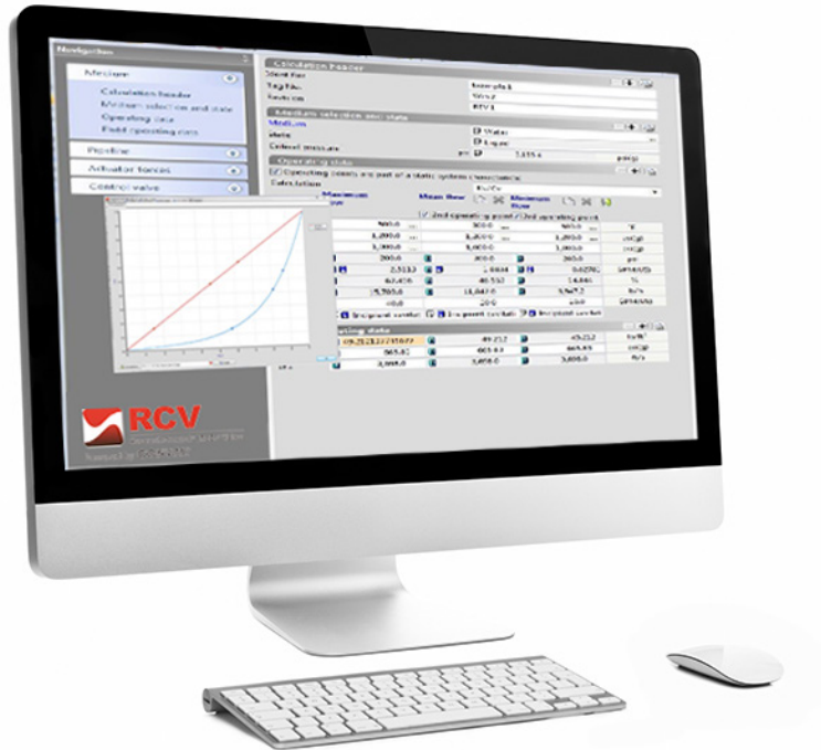
Figure 5. With an advanced valve-sizing tool, end-users can graphically visualize their operational set points and review various trims and characteristics.