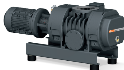
Figure 6: Busch Panda WV 1000 C rotary lobe vacuum booster. Panda sizes range from 315 - 6,800 CFM.

Dry rotary lobe vacuum boosters are ideal to increase the pumping speed, together with a backing pump in a vacuum system. Some rotary lobe blowers use bypass valves whereas others can be equipped with a pressure switch or Variable Frequency Drives (VFD) (Figure 6).