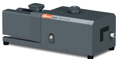
Figure 3: Busch Mink MM 1142 BV dry claw vacuum pump. Mink sizes range from 40 - 680 CFM.

Dry claw vacuum pumps were developed for a wide range of applications and are used in processes where constant vacuum and high pumping speed are required. They are contact-free, simple to disassemble and are easily maintained (Figure 3).