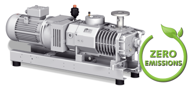
Figure 1: COBRA NC dry screw vacuum pump

Dry screw vacuum technology is preferred in most chemical and pharmaceutical applications since no operating fluid is required to compress the process gas. In a screw vacuum pump, two interlocking screw-shaped rotors rotate in opposite directions (Figure 1 and Figure 2). The process vapors are drawn in, trapped between the cylinder and screw chambers, compressed, and transported to the gas outlet. During the compression process the screw rotors do not contact each other or the cylinder. Precise manufacturing and minimal clearance between the